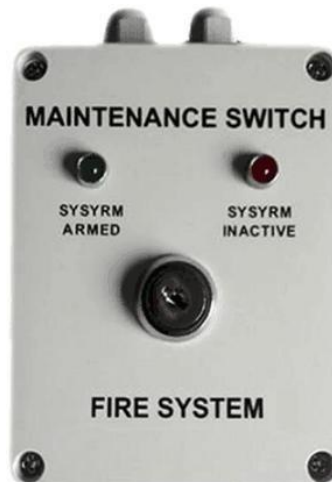
FIGURE 1. PRODUCT PICTURE

This MAINTENANCE panel is a key switch, which disconnects actuation circuits in the system to prevent accidental discharge during maintenance operations.